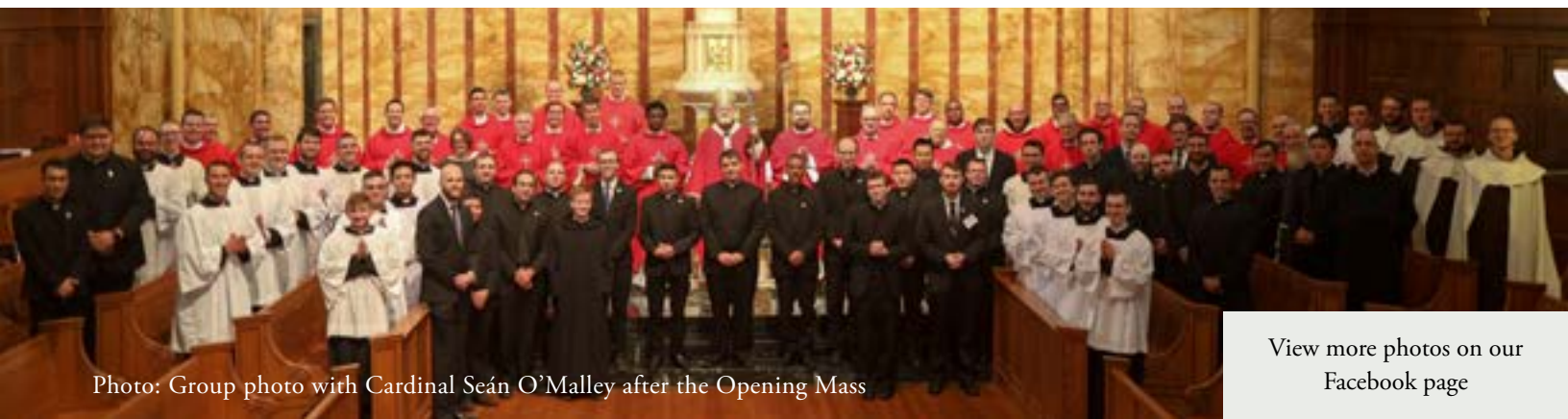
Photo: Group photo with Cardinal Seán O'Malley after the Opening Mass