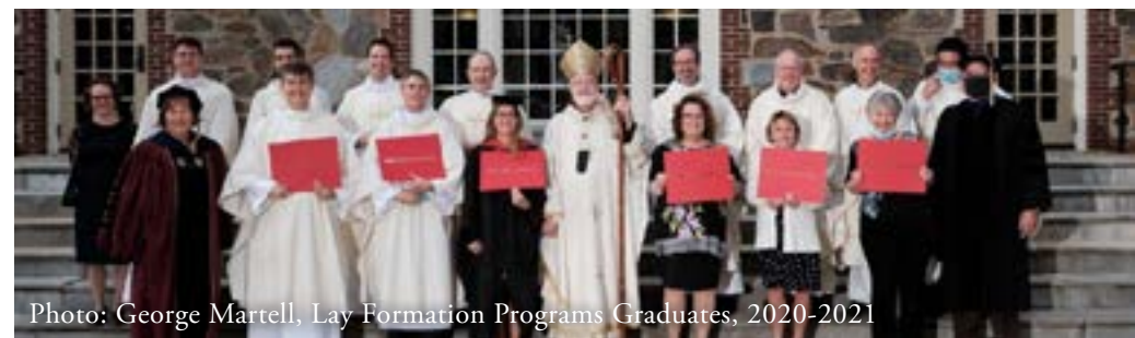
Lay Formation Programs Graduates, 2020-2021

Lay Formation at Saint John's is an academic and pastoral formation program for Catholic men and women, deacons, and professed religious who are interested in taking the 'next step' on their Christian journey of ministry. Those who apply to the Lay Program seek an opportunity to deepen their union with Christ and develop their ability to par-